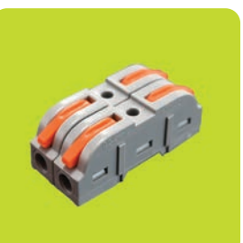
FRED EASY 2x 4 mm<sup>2</sup>

Modular, Composable, Ultra-fast, Self-extinguishing.