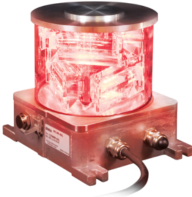
Patents: EP 1966535B1 & US 7816843

Red medium intensity FAA L-864 (AC 150/5345-43J) ETL certified