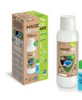
MAGIC GEL SPRINT is available in 2 version which are sustainable in terms of packaging and in terms of volume, as they are specifically designed for filling boxes in the most commonly used formats.