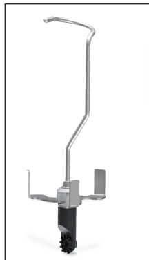
PP-3U MCL Clamp dispenser