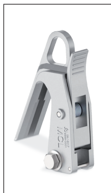
MCL Medium voltage clamp