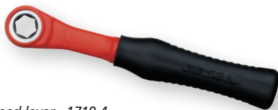
Feed lever - 1719 4