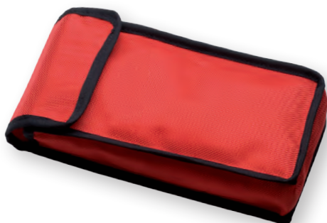
Soft nylon case - AB6230